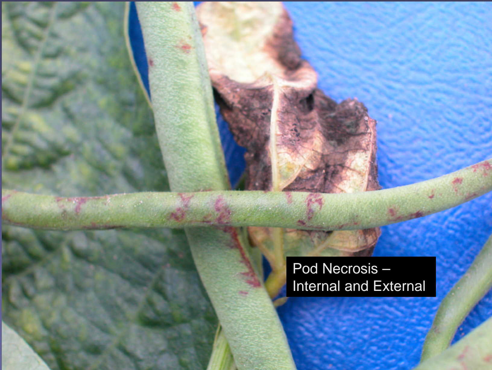
Pod Necrosis – Internal and External