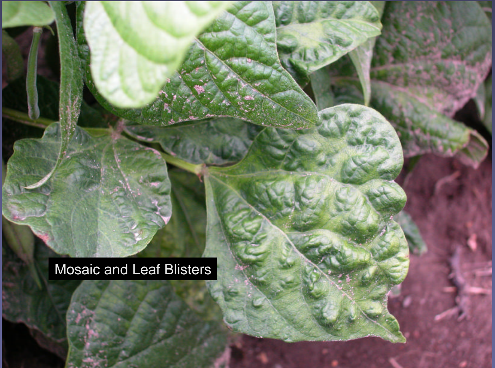
Mosaic and Leaf Blisters