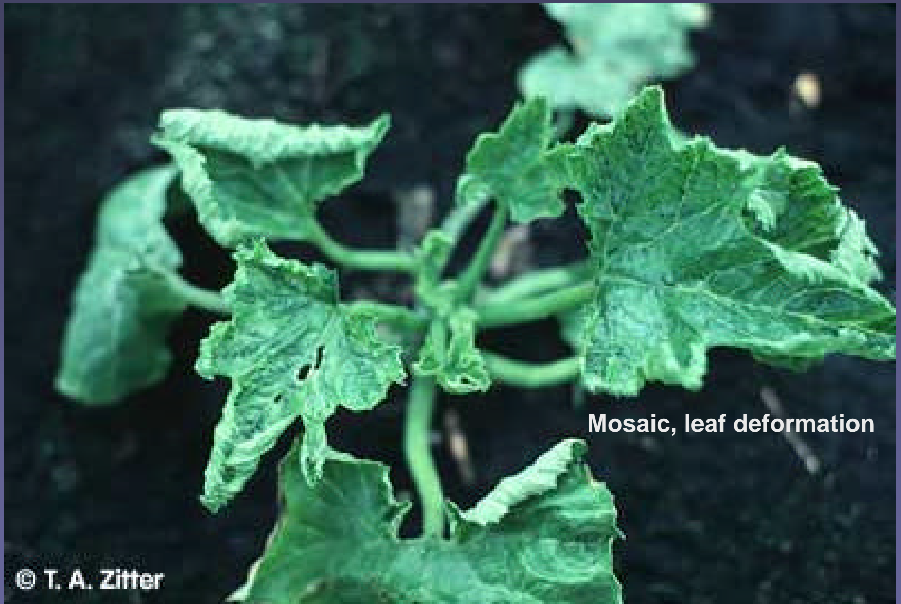
Mosaic, leaf deformation