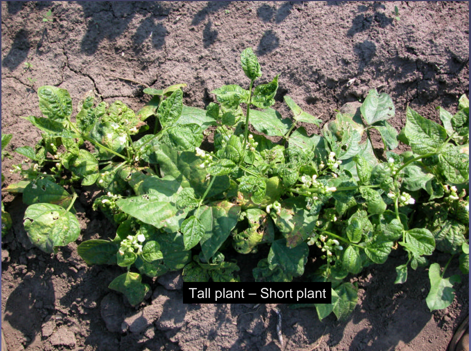
Tall plant – Short plant