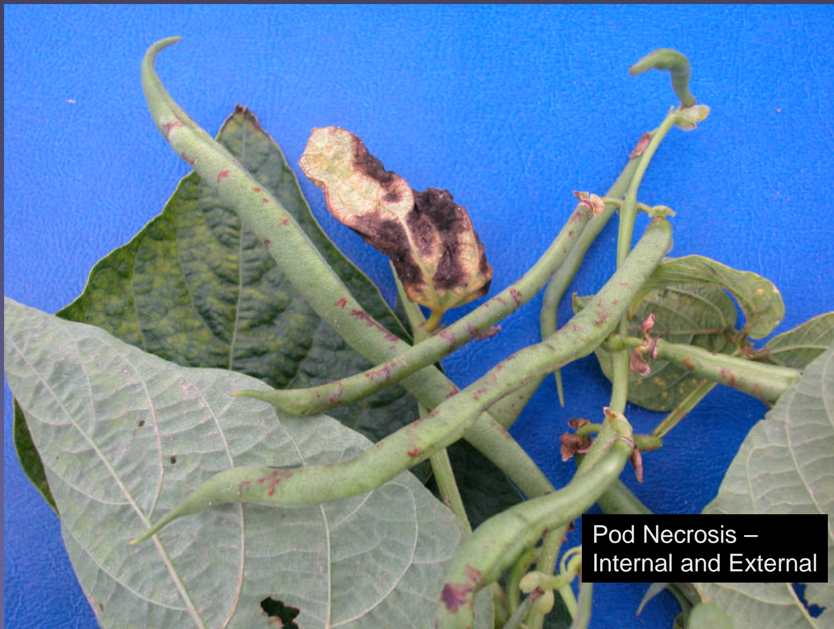
Pod Necrosis – Internal and External