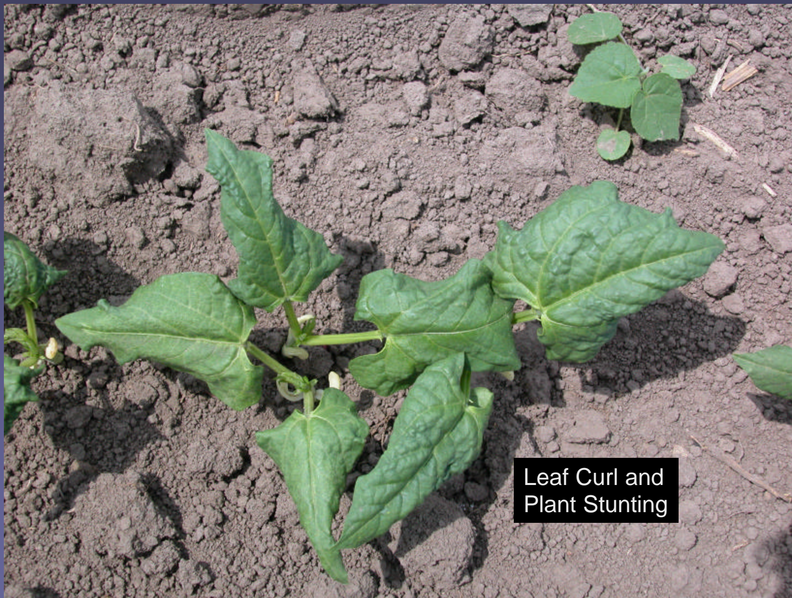
Leaf Curl and Plant Stunting