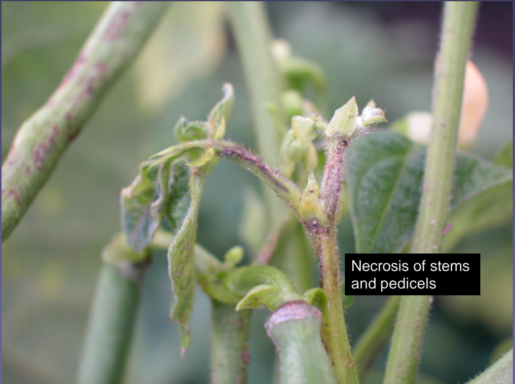
Necrosis of stems and pedicels