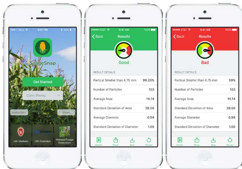
Figure 3. SilageSnap app for image analysis assessment of corn kernel particle size distribution in chopped and processed corn silage. From left to right: 1) Home Screen, 2) Good Results Screen, 3) Bad Results Screen.