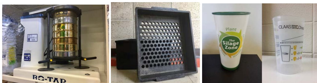
Figure 1. Typical methods of assessing corn kernel particle size in chopped and processed corn silage. From left to right: 1) Ro-Tap™ Sieving, 2) Penn State Particle Separator, 3) One liter cups.

Typical assessment of corn kernel particle size distribution is done by either sieving a sample, utilizing the Penn State Particle Separator, or visually assessing a known volume of chopped and processed corn silage (Figure 1). These assessment methods all have problems in that they are either subjective in their assessment methods or require assessment off-site and results do not return until after harvest has been completed.