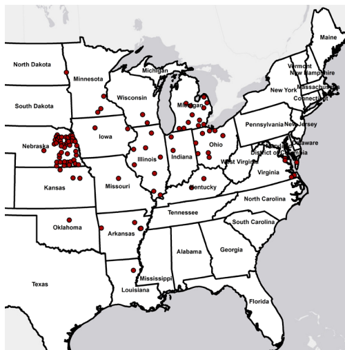
Figure 1. Locations of individual studies from which data were combined into a single database.

Extensive research to date has documented the impacts of N fertilizer source, application rate, application method, and seasonal timing on U.S. soybean yield. Many of these studies show inconsistent response of soybean yield to N application within and across states which may have been due to differences in soybean cultivars, soil properties, climatic conditions during the growing season, topography, and crop management practices (Osborne and Riedell, 2006). Because a single study was not conducted at multiple U.S. locations for several years, we combined data from multiple soybean N fertilization studies across multiple locations and years. Thus, the objectives of this study were to examine the effects of N fertilizer in terms of N-application number (single or split applied), N-method (soil surface, soil incorporated, foliar, or a combination of these), N-timing (pre-plant, at-planting, Vn or Rn growth stages, or combination of these), and N-rate on soybean seed yield across the U.S.